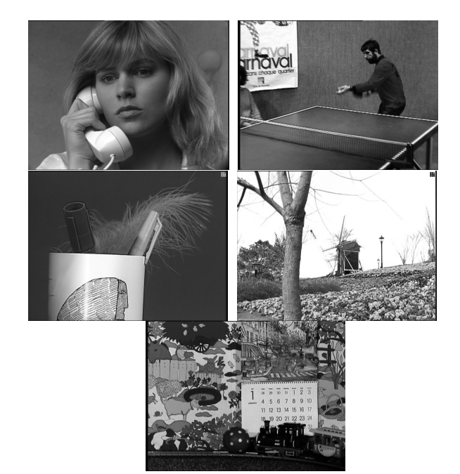
Fig. 2. The five used reference clips in the evaluation process

A latest perceived quality metric, which provides very reliable assessment of the video quality is the SSIM metric [1], [3]. The SSIM is a FR metric for measuring the structural similarity between two image/video sequences, exploiting the general principle that the main function of the human visual system is the extraction of structural information from the viewing field. The concept of averaging the SSIM for the whole video duration can be exploited for deriving a single perceived quality measurement, which is more practical, especially for the service providers.